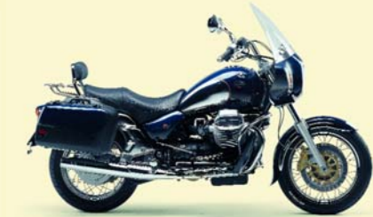
Blu State (California EV Touring) (blue)