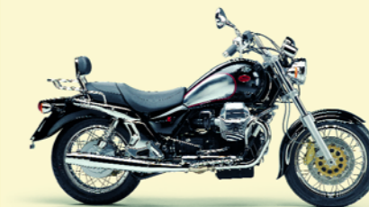
Nero Oyster (black)