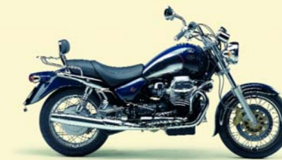
Blu State (blue)