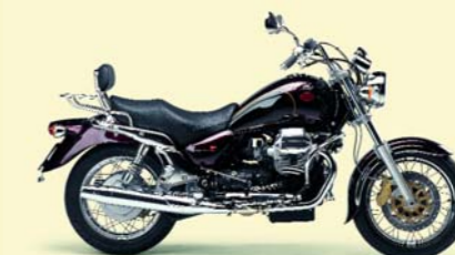
Rosso Vintage (red)