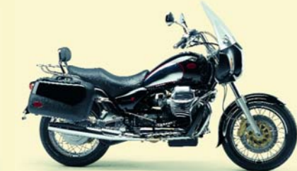
Nero Oyster (California EV Touring) (black)