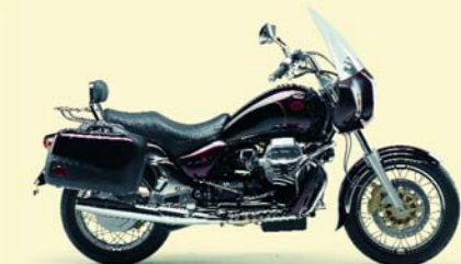
Rosso Vintage (California EV Touring) (red)